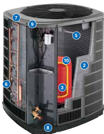
3-ton Allegiance 15 shown. Other models may vary.