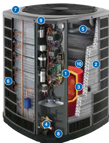
3-ton Allegiance 20 shown. Other models may vary.