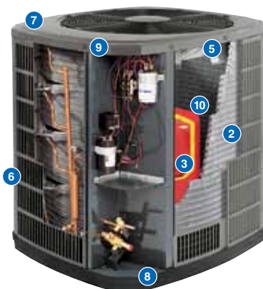
3-ton Allegiance 13 shown. Other models may vary.