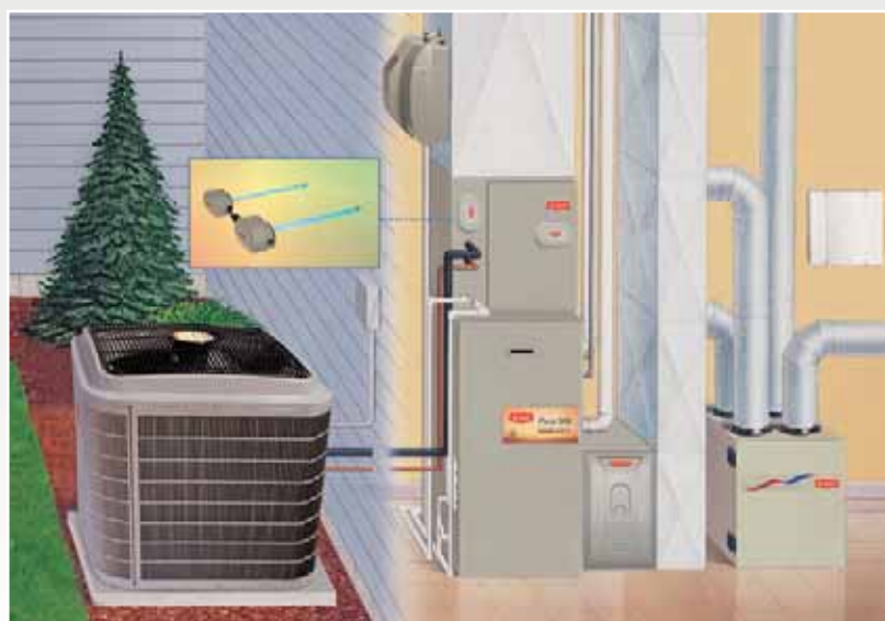
Air Conditioner and Gas Furnace System